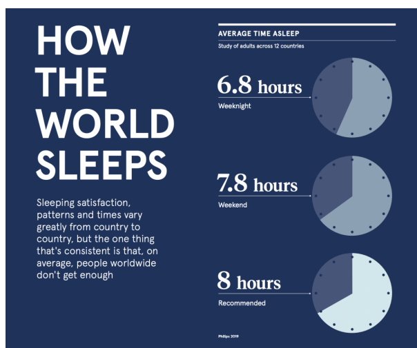
Figure 1 (Yardney, 2022)

The contemporary trend of sleeping habits presents a disturbing narrative. The World Health Organization has pointed to a 'global epidemic of sleeplessness' (throughout industrialized nations) with roughly two-thirds of adults sleeping less than 8 hours a night (Lyon, 2023). Figure 1 illustrates the inadequacy of sleep on a worldwide scale.